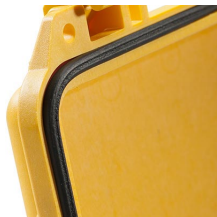
1753 Replacement O-ring