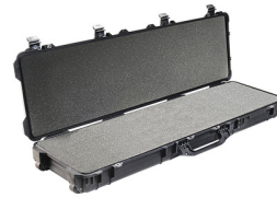
1750WF With Foam